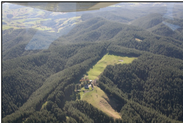
Gary ZM4G used this impressive hill top QTH to win the Oceania Single Operator 40M High Power category in both the PHONE and CW sections, as well as setting a new Oceania record in the PHONE section.